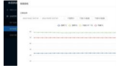
Curve viewing interface