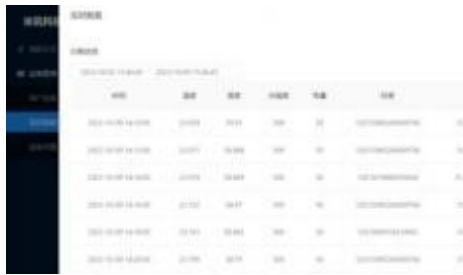
Live view interface