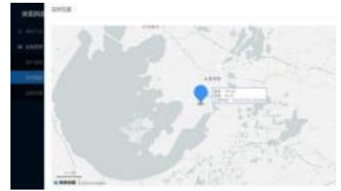
GPS positioning interface