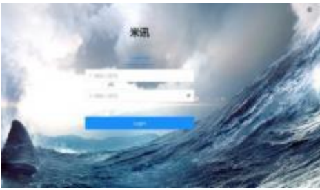
Platform login screen