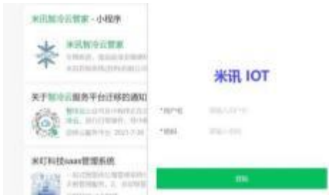
Software login screen