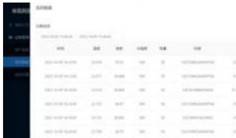
Live view interface