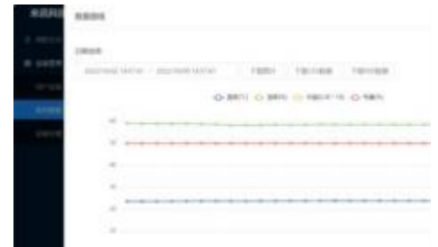
Curve viewing interface