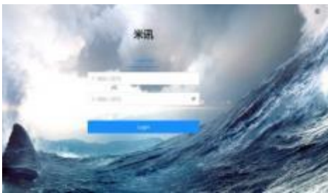
Platform login screen